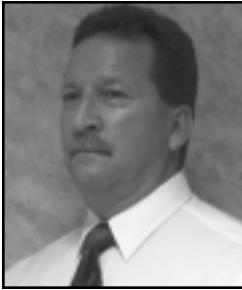
Brother Knights, Happy New Year!